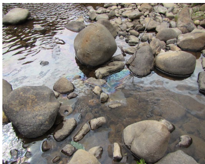
Colourful sheen from an oil spill.