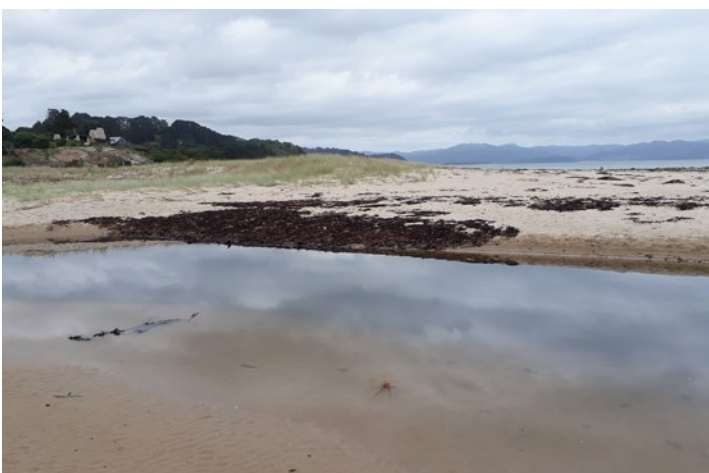
Kuaotunu Stream mouth

Faecal bacteria typically come from the intestines of warm blooded animals (e.g. cows, sheep and humans). High levels of bacteria indicate an increased risk of getting sick after swimming.