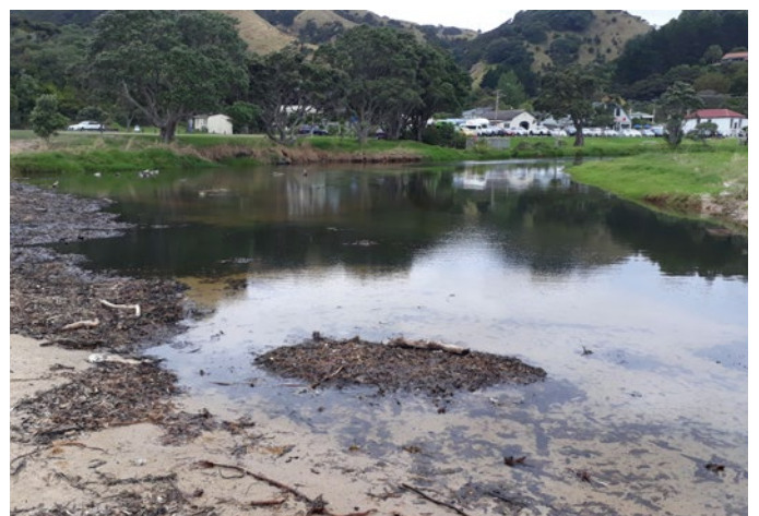
The Kuaotunu Stream mouth closes occasionally as a result of sand being moved around during storms.