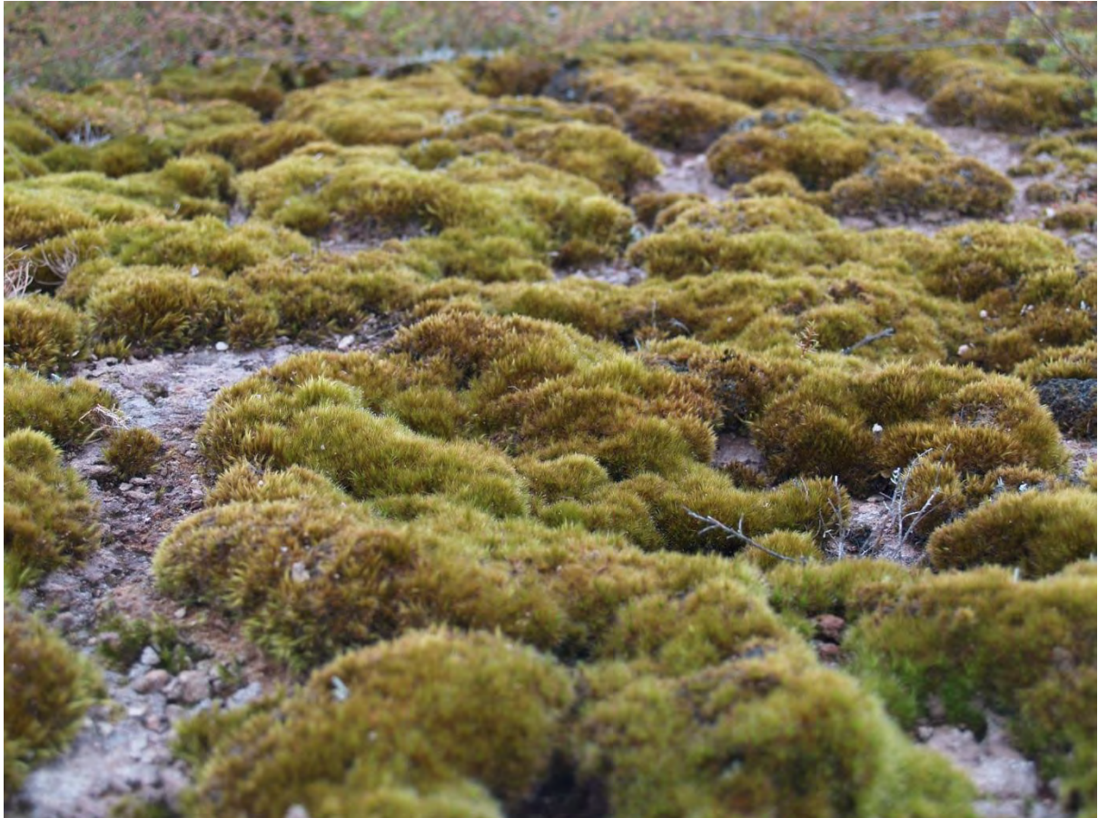
Figure 7: Campylopus pyriformis mossfield at Karapiti/Craters of the Moon, Wairakei

Occurs on very hot (average 72 °C) ground at Taheke and Wairakei (Karapiti/Craters of the Moon).