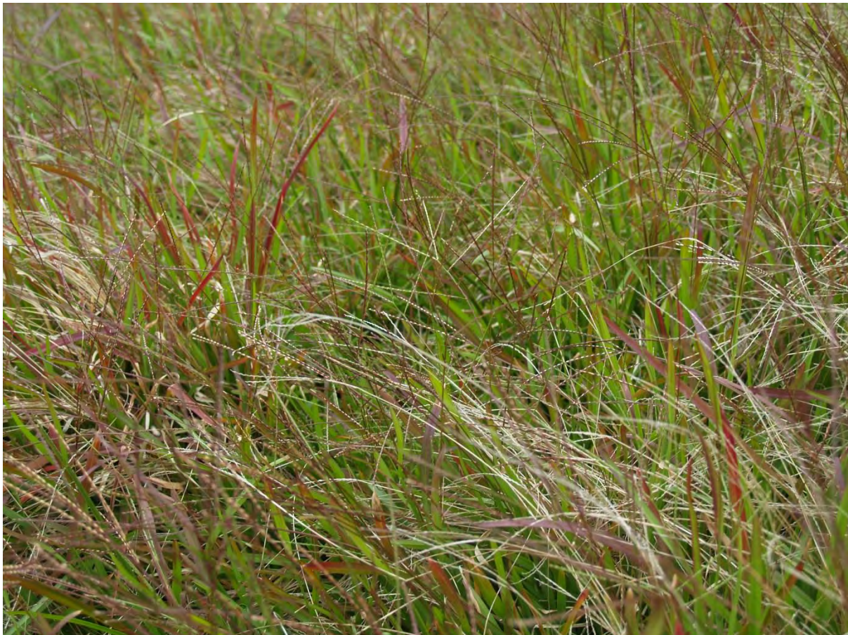
Figure 8: Carpet grass grassland at Papakiore Springs, Tikitere

This is the only main type dominated by exotic species.