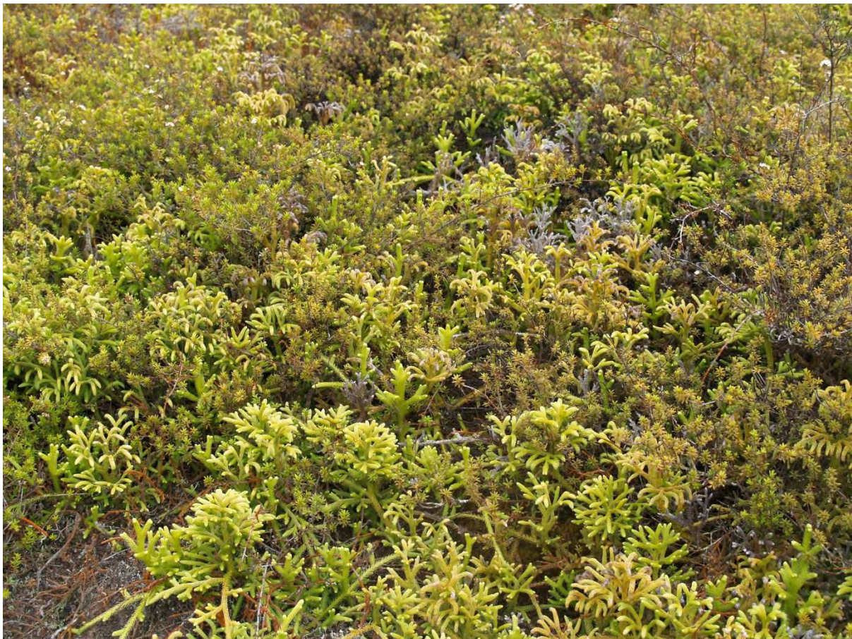
Figure 9: Prostrate kānuka/thermal clubmoss fernland at Karapiti/Craters of the Moon, Wairakei

Occurs on very hot (68 °C) ground on geothermal sites at Wairakei (Karapiti/Craters of the Moon) and Tauhara (Spa/Otumuheke Stream).