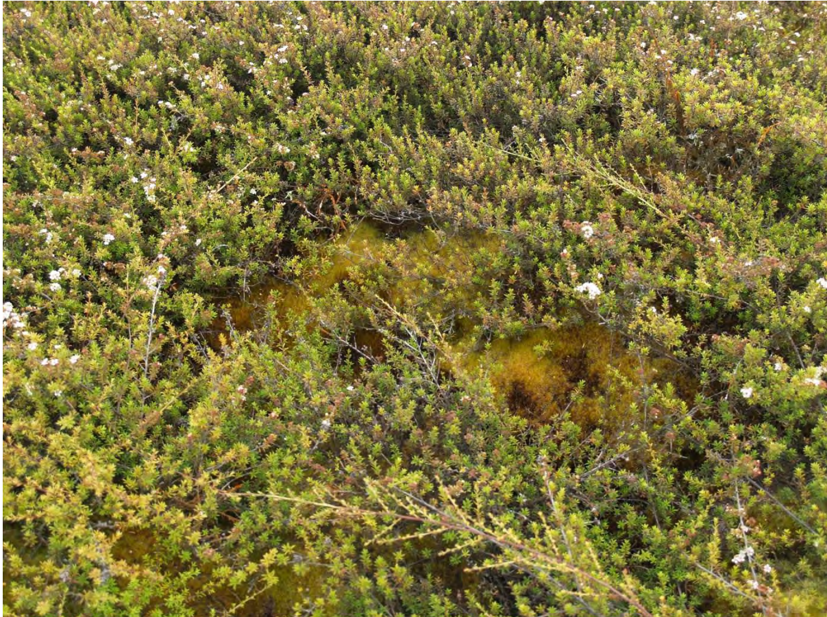
Figure 14: Prostrate kānuka/ Campylopus pyriformis shrubland at Karapiti/Craters of the Moon, Wairakei

Occurs on hot (50 °C) ground at Wairakei (Karapiti/Craters of the Moon, Upper Wairakei Stream).