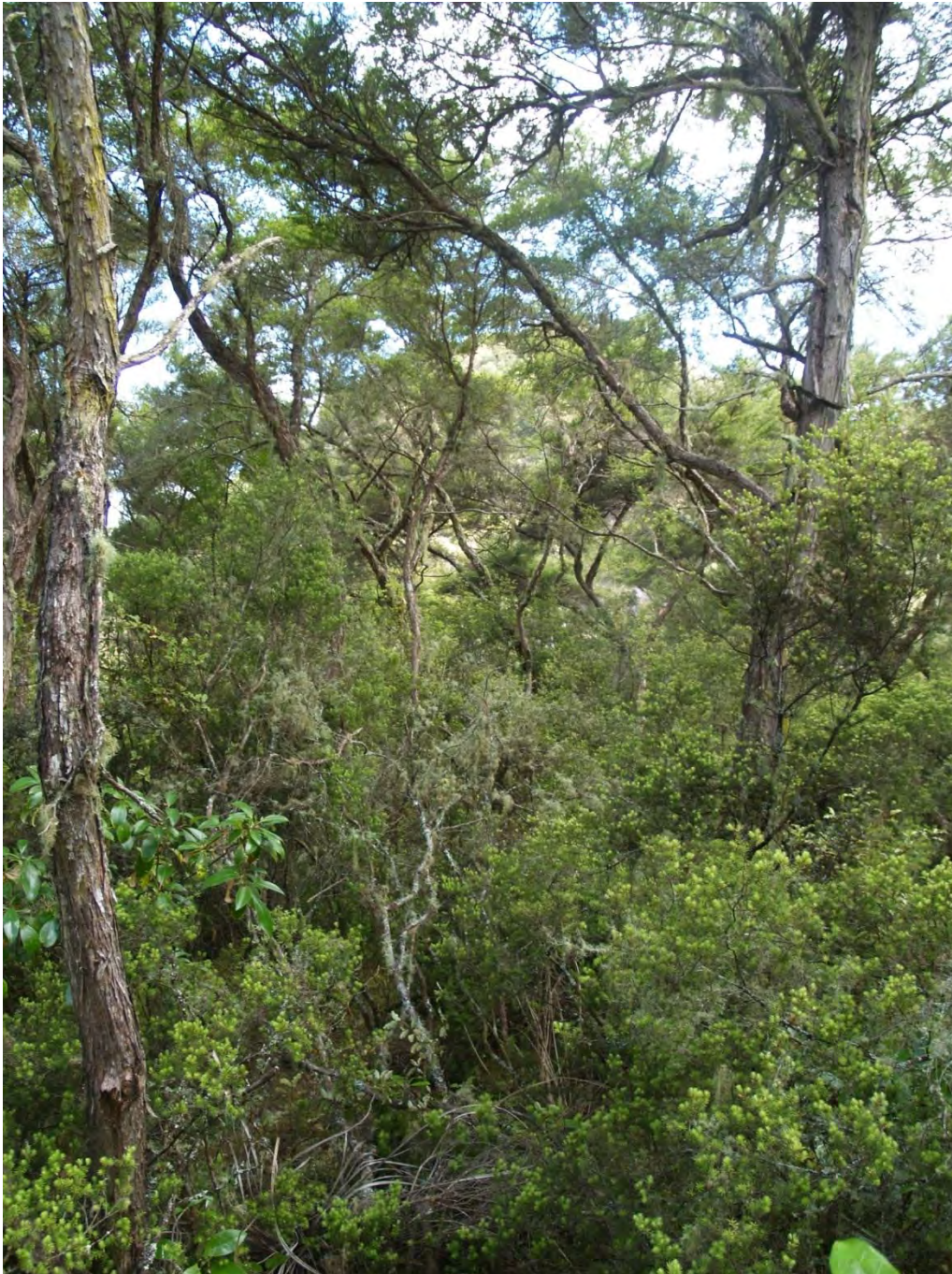
Figure 18: Mingimingi–prostrate kānuka/inkberry scrub on Rainbow Mountain/Maungakakamea