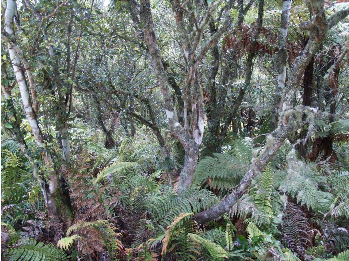
Figure 21: Kāmahi/mingimingi-prickly heath-bracken forest on Rainbow Mountain/Maungakakamea

Occurs on slightly heated (18 °C) ground on the margins of geothermal sites at Te Kopia.