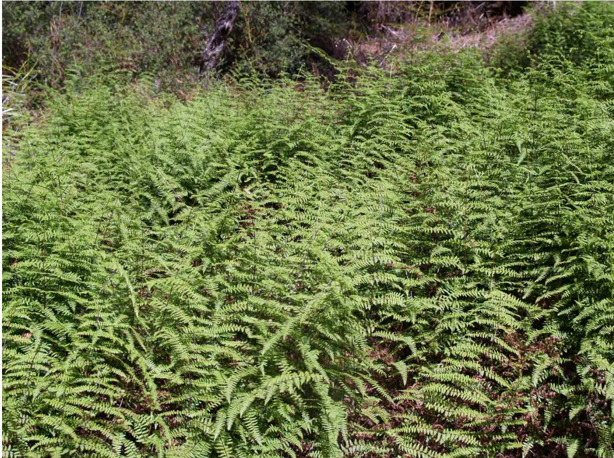
Figure 11: Hypolepis distans fernland at Cemetery Reserve, Rotorua

Occurs on warm (21 °C) ground on the margins of geothermal sites at Taheke, Tikitere (Parengarenga Springs), and Rotorua (Cemetery Reserve, Whakarewarewa).