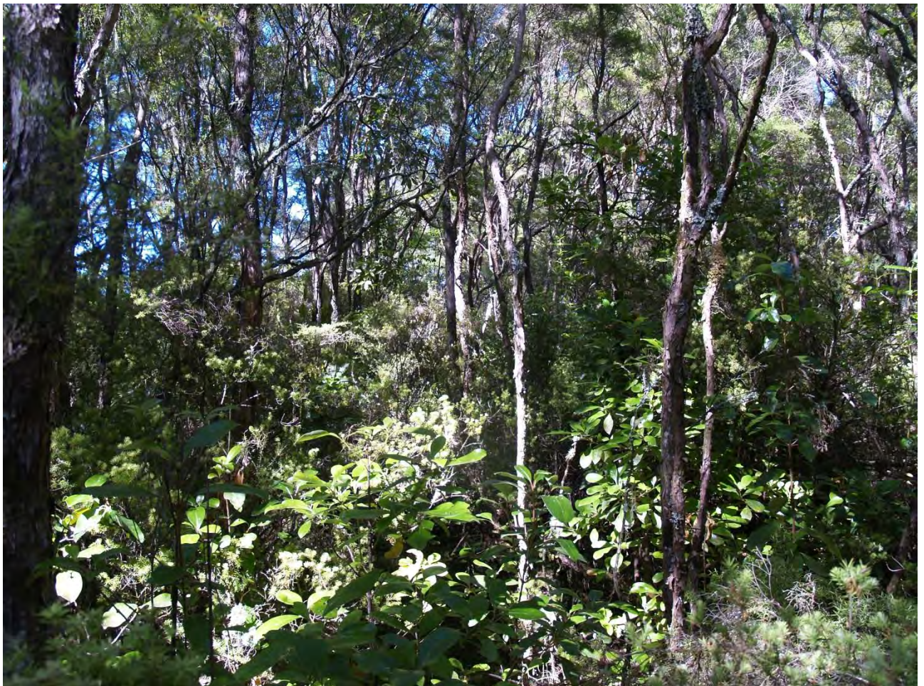
Figure 20: Kānuka /( Coprosma rhamnoides –mingimingi–prickly heath) treeland at Parimahana, Kawerau

This is one of two associations also common away from geothermal areas.