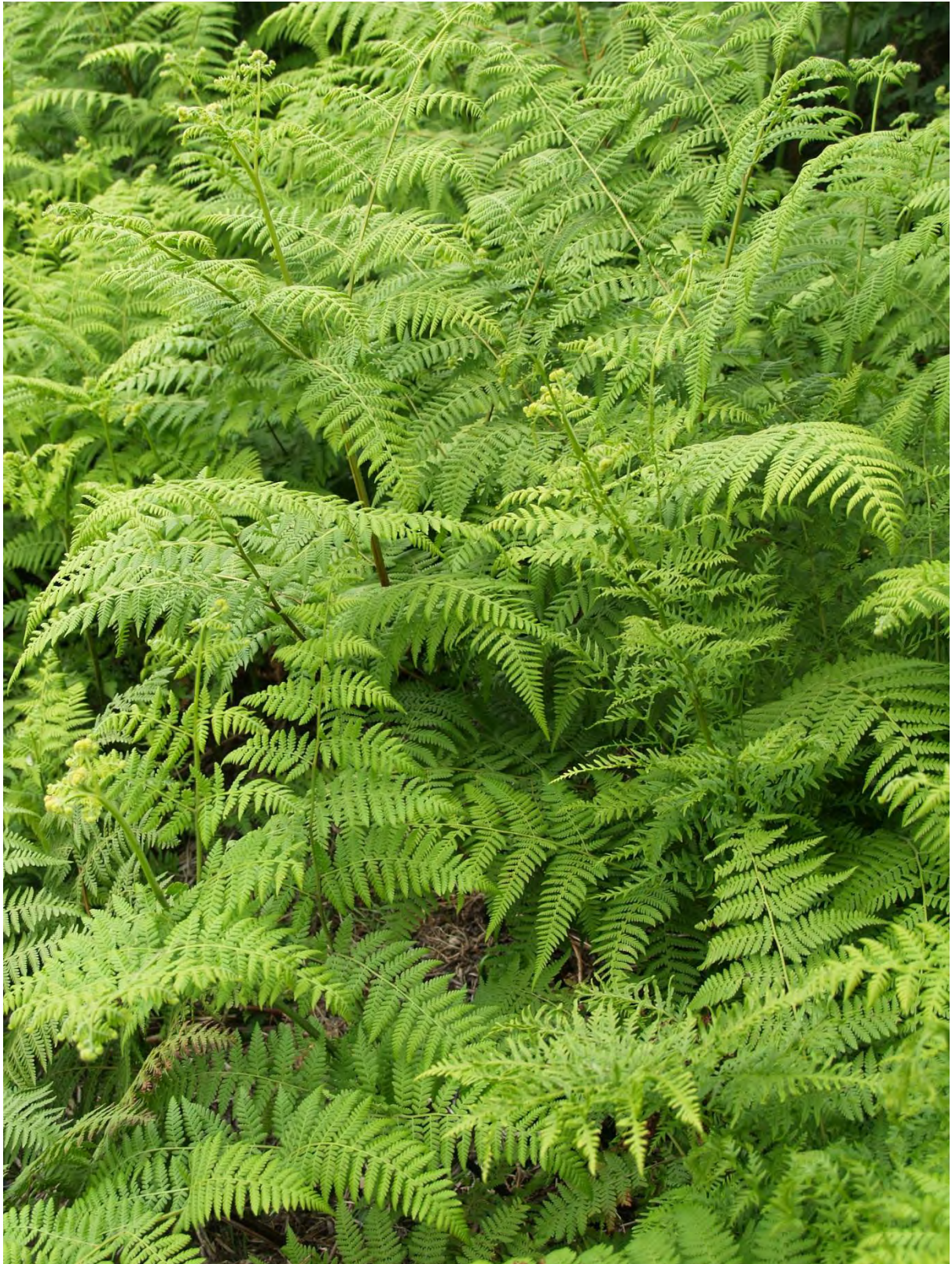
Figure 5: Giant hypolepis at Waimangu