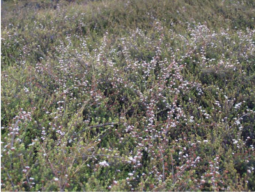
Figure 2: Prostrate kānuka at Crown Rd, Taupo

Thermal ladder fern (threatened), formerly thought to be the same as the exotic tropical ladder fern commonly growing as a weedy garden escape, is also confined to geothermal sites in New Zealand.