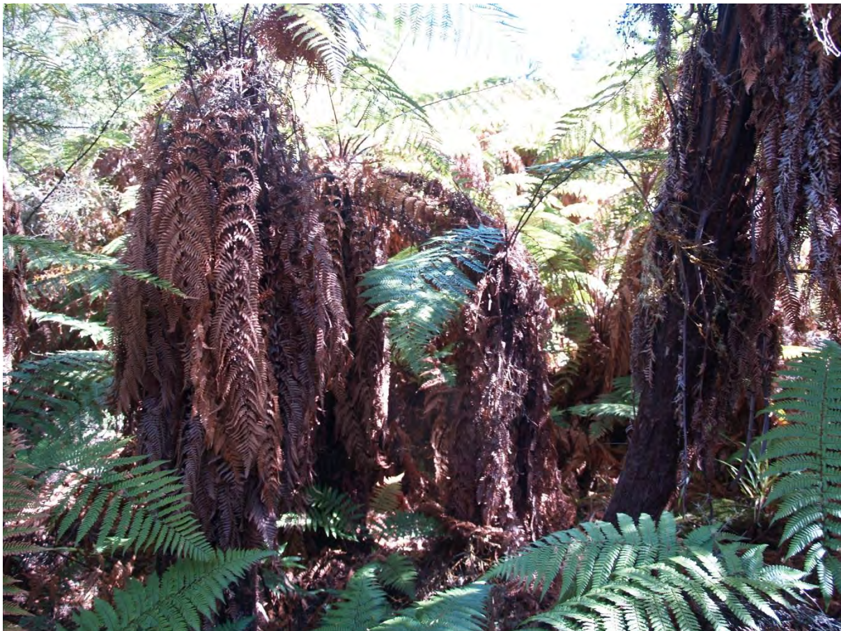
Figure 19: Wheki/inkberry treefernland at Waiotapu North

Occurs on slightly heated (19 °C) ground on the margins of geothermal sites at Taheke, Waiotapu (Waiotapu North), and Orakei-Korako.