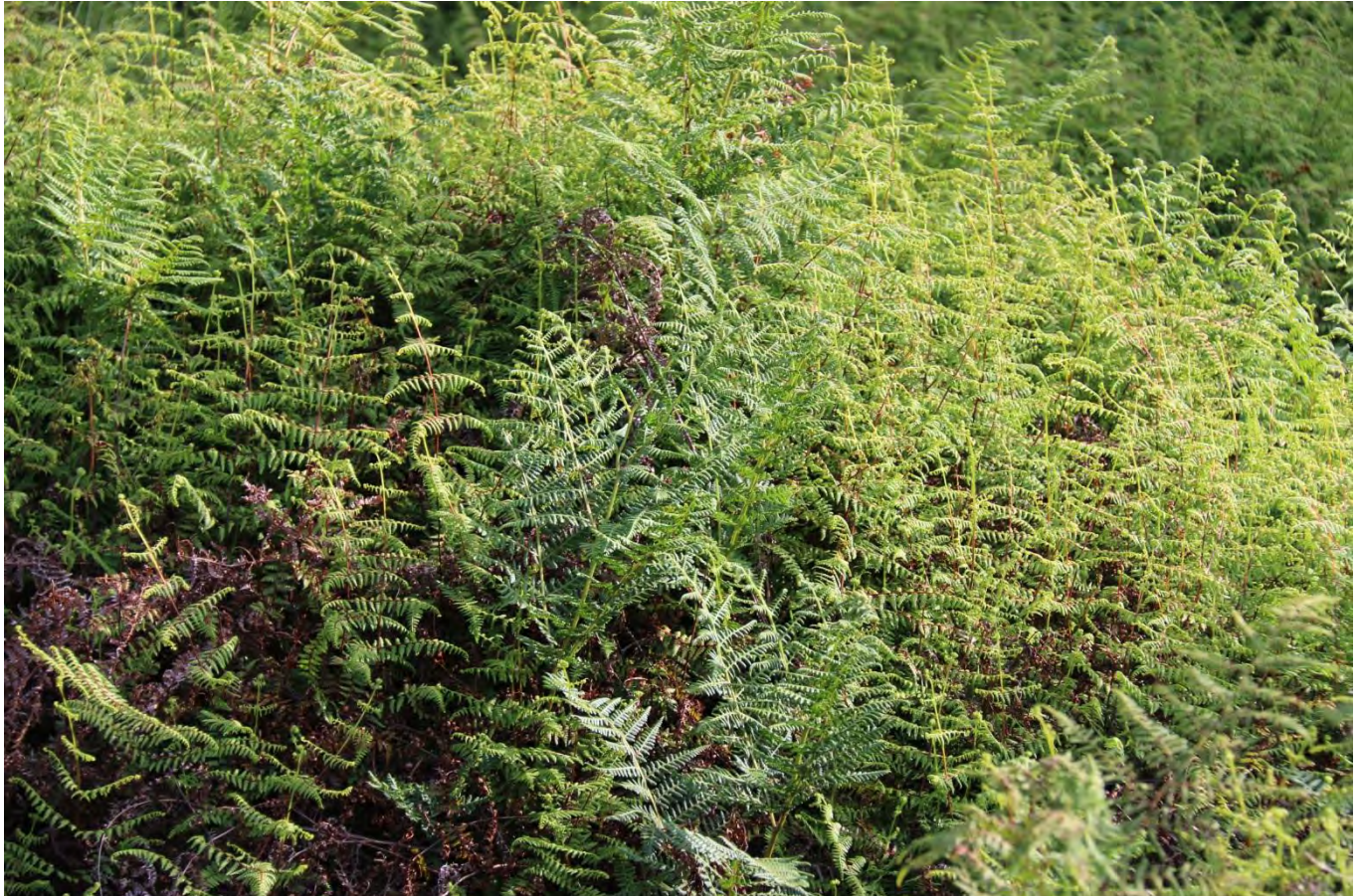
Figure 10: Hypolepis ambigua fernland at Parengarenga Springs, Tikitere

Occurs on warm (21 °C) ground on the margins of geothermal sites at Tikitere (Otutara Springs, Parengarenga Springs) and Te Kopia.