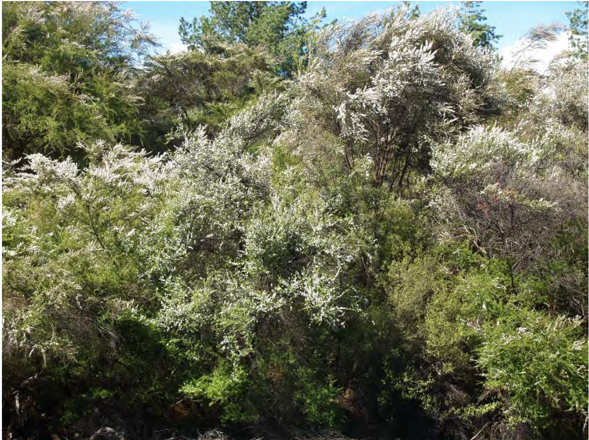
Figure 12: Mānuka shrubland at Waiotapu North

This is one of two associations also common away from geothermal areas.