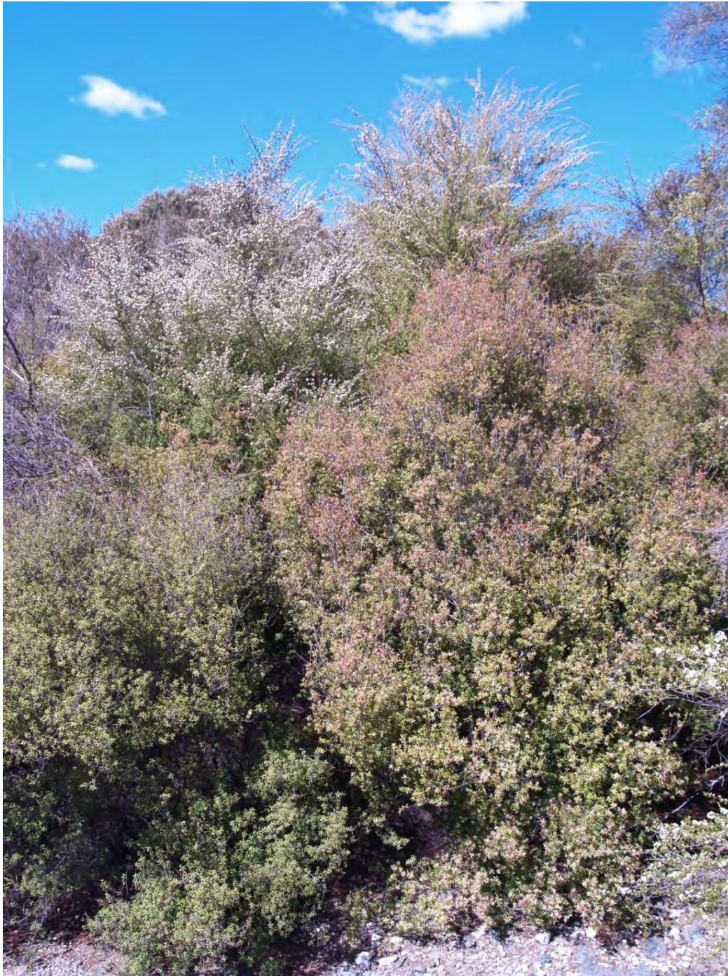
Figure 13: Prostrate kānuka–mingimingi shrubland at Ngapuna, Rotorua

Occurs on warm (25 °C) ground on the margins of geothermal sites at Kawerau (Parimahana Scenic Reserve), Taheke, Tikitere (Hell's Gate), Rotorua (Ngapuna, Sulphur Point, Whakarewarewa), Waiotapu (Waiotapu North, Waiotapu Thermal Area), and Te Kopia.