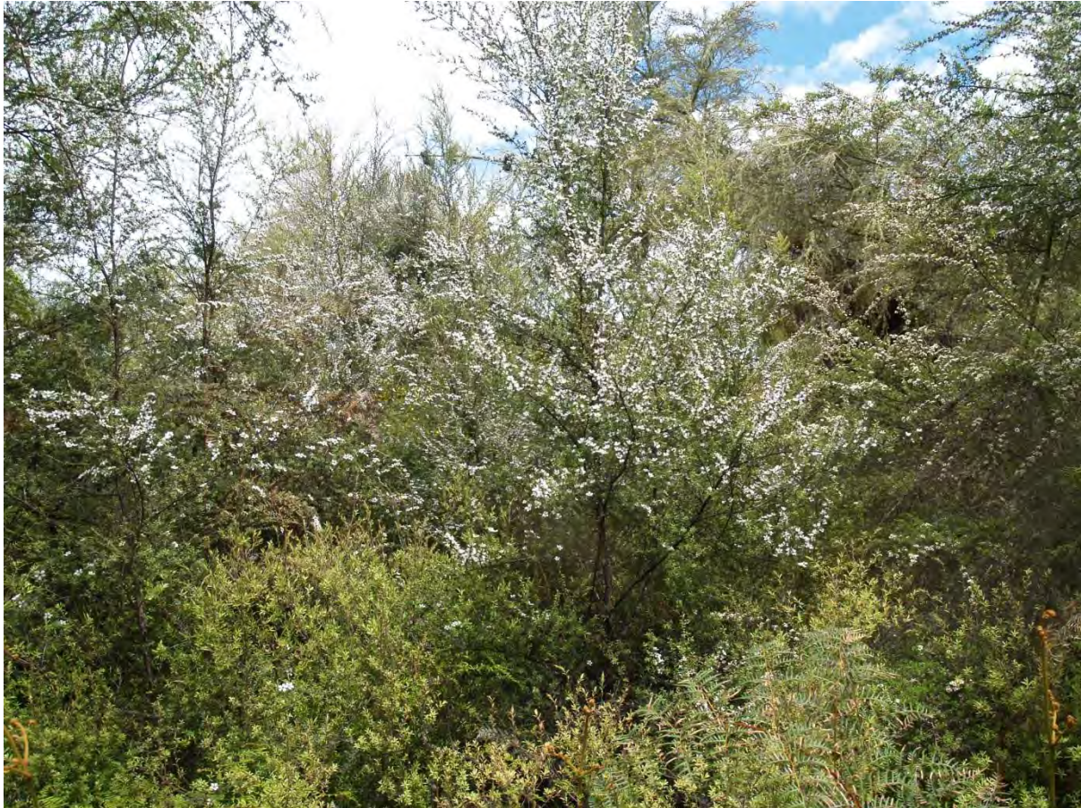
Figure 15: Mānuka–mingimingi–prostrate kānuka/bracken–inkberry–ring fern shrubland at Waiotapu North

Occurs on slightly heated (17 °C) ground on the margins of geothermal sites at Waiotapu.