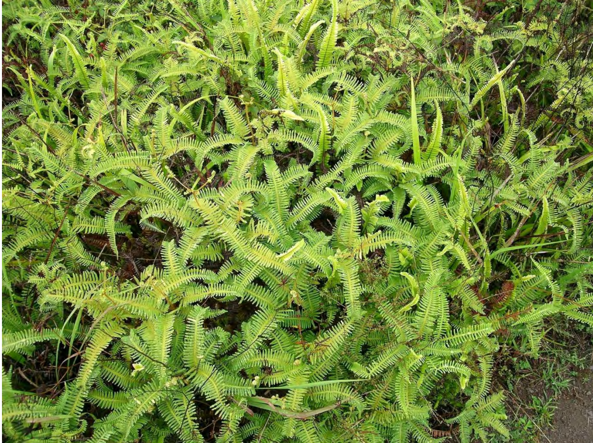
Figure 4: Thermal tangle fern at Karapiti/Craters of the Moon, Wairakei

Then there is a suite of other plants that are widespread in warmer countries but in New Zealand are largely confined to geothermal sites, where the warm frost-free environment allows them to flourish. They include several ferns (thermal tangle fern, Christella dentata , Cyclosorus interruptus and giant hypolepis) and a small sedge ( Fimbristylis velata ), all threatened.