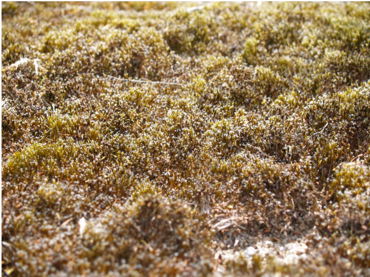
Figure 6: Campylopus introflexus mossfield at Waimangu

Occurs on hot (average temperature at 10 cm depth 44 °C) ground at Waimangu.