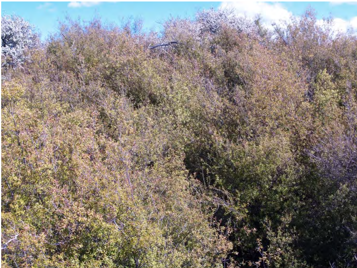
Figure 17: Mingimingi scrub at Ngapuna, Rotorua

Occurs on slightly heated (17 °C) ground on the margins of geothermal sites at Taheke, Tikitere (Hell's Gate, Papakiore Springs), Rotorua (Ngapuna, Kuirau Park, Whakarewarewa), Waiotapu (Waiotapu North), and Reporoa (Longview Road).