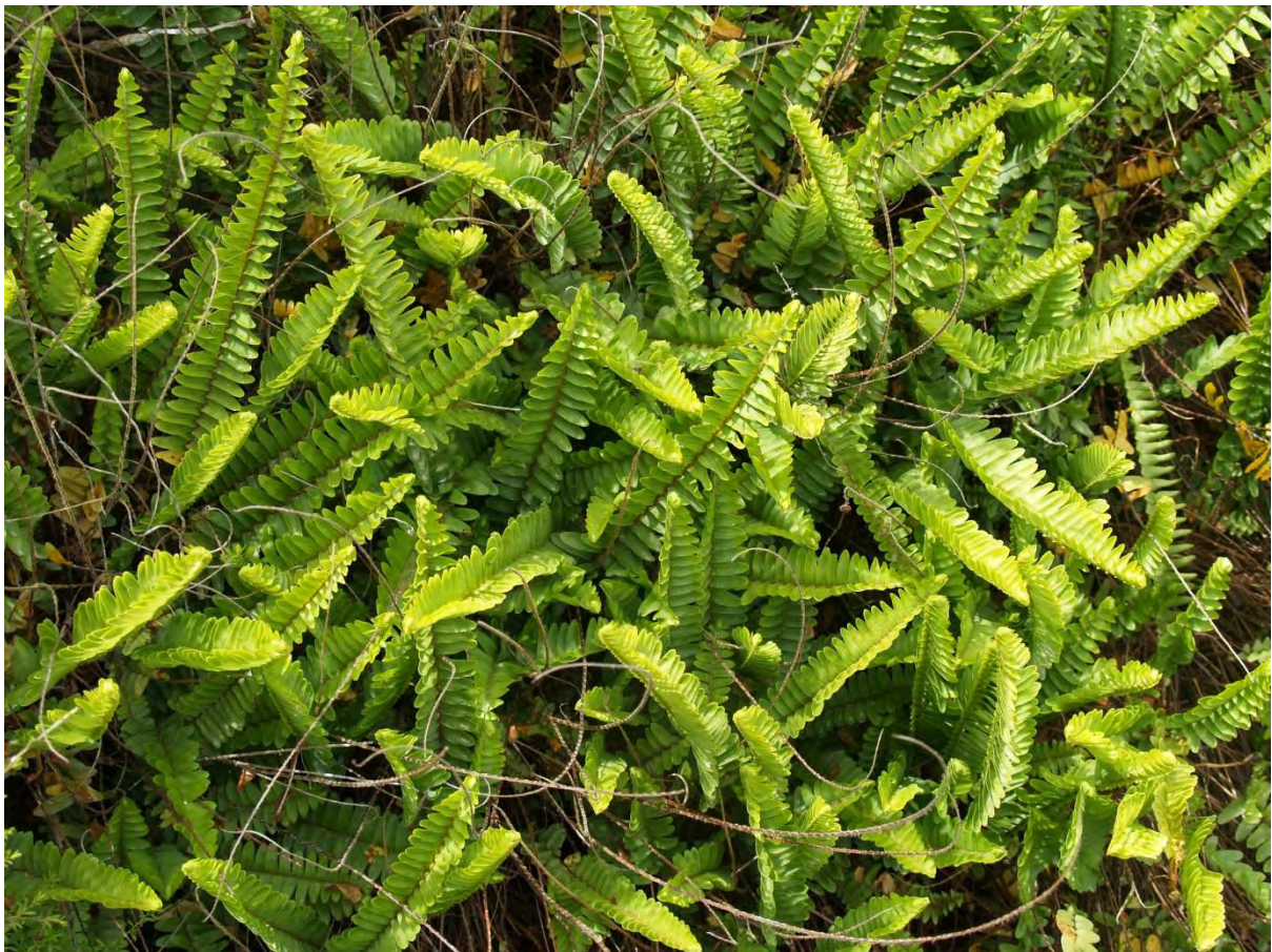
Figure 3: Thermal ladder fern at Waimangu

Thermal ladder fern (threatened), formerly thought to be the same as the exotic tropical ladder fern commonly growing as a weedy garden escape, is also confined to geothermal sites in New Zealand.