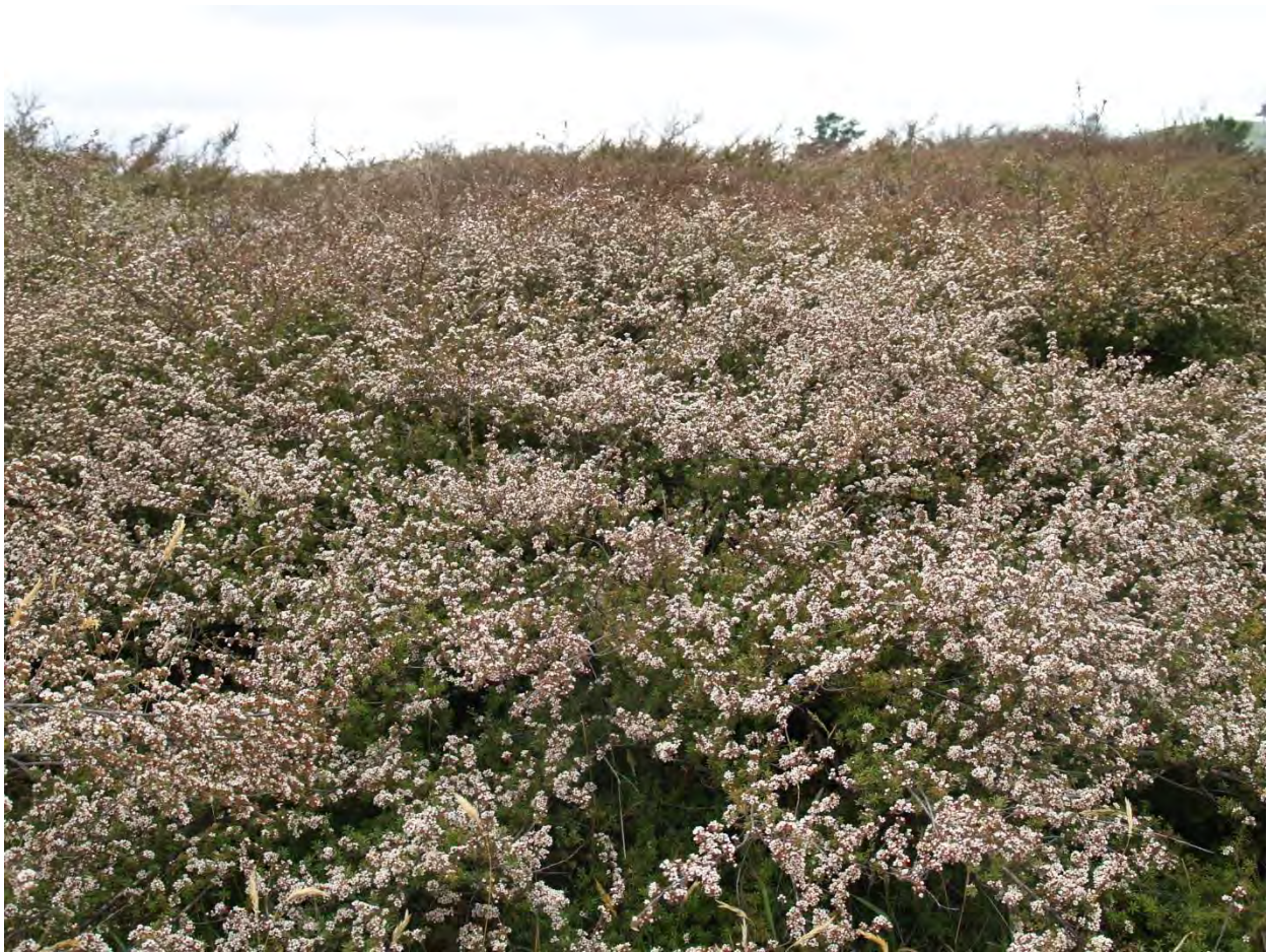
Figure 16: Prostrate kānuka scrub at Crown Rd, Taupo

This is the most characteristic and widespread association of geothermal sites.