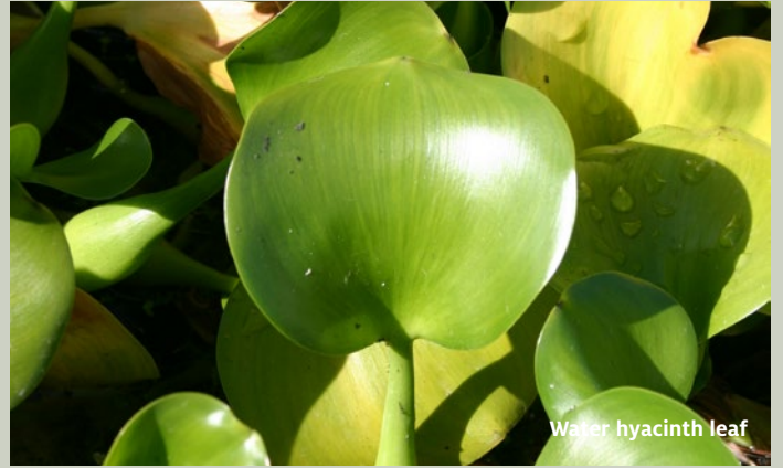
Water hyacinth leaf