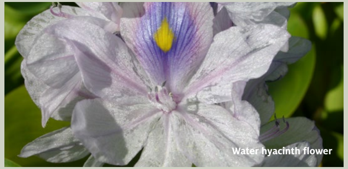
Water hyacinth flower

If you've seen water hyacinth or think you've seen it, please contact the Ministry for Primary Industries on freephone 0800 80 99 66.