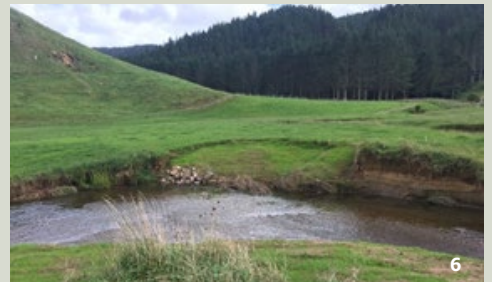
1 Several large willows growing across the Wentworth River were cleared over a 100m stretch in January 2017. Local reports indicate that this mitigated the extent of flooding in March and April. 2 Before: Waikiekie Stream bursts its banks due to a blockages. 3 After: Blockages have been removed but the riparian strip is still clogged with forestry debris. 4 Forestry debris blocks the entire Te Weiti Stream channel, upstream of the SH25 bridge – the channel has been cleared and cleanup continues. 5 The Te Weiti Stream flood plain was heavily impacted by forestry debris and a stream flowed through farmland, upstream of SH25 bridge – the stream is now flowing in its channel and cleanup continues. 6 Erosion protection works undertaken in February 2018 using imported rock spall, live tree tying and gravel management.