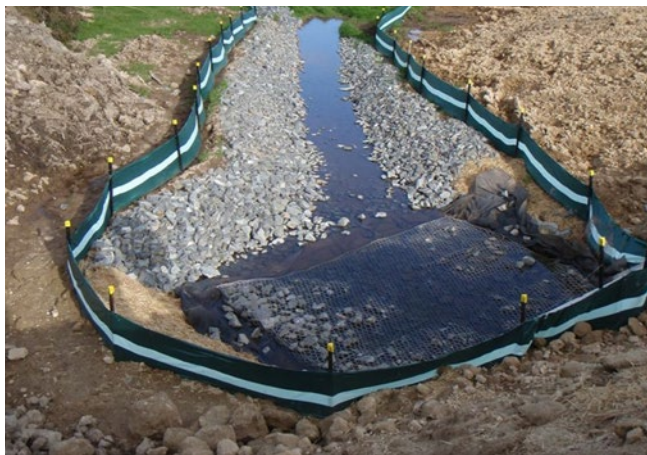
Appropriate erosion protection controls for in-stream works