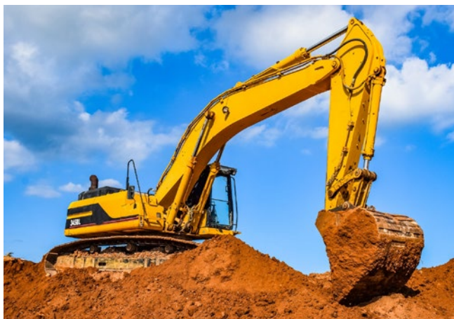
Knowing the rules before you dig helps protect you and your property

We're always on call for the environment and to help you get your projects done right, working with landowners and contractors alike to strike the right balance for our region.