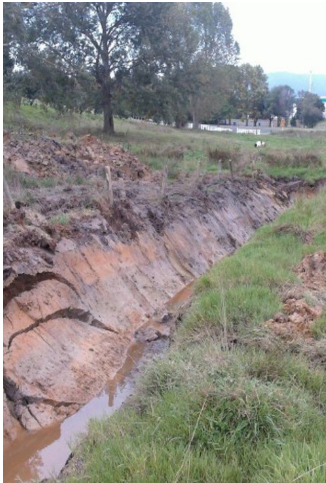
Contractor prosecuted for illegal earthworks near water