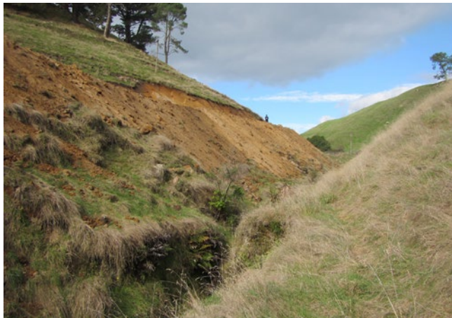
Unlawful earthworks due to lack of erosion and sediment controls

Without proper controls, earthworks can release excessive amounts of sediment into our wetlands, waterways and coastal areas. This can have serious impacts on water quality, natural ecosystems and local businesses, often with serious long-term effects. It also affects everyone's enjoyment of the environment, threatens food sources and degrades areas of cultural significance to Māori communities.