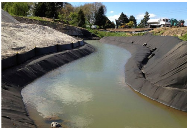
Lining a channel with geotextile sheets helps prevent erosion and sedimentation