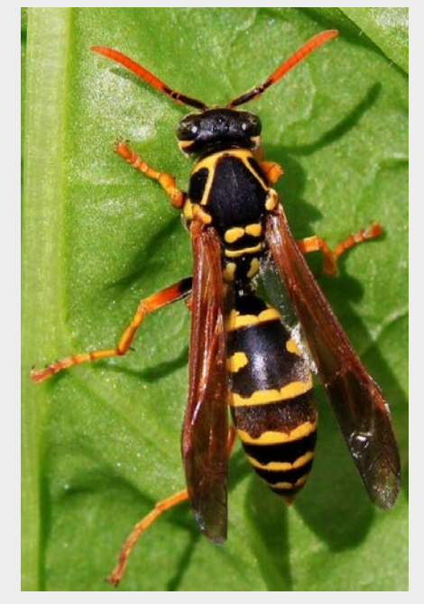
Asian Paper Wasp.