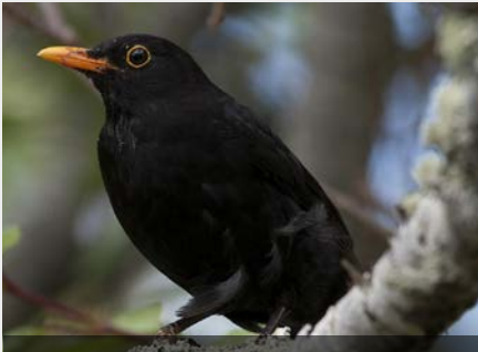
Eurasian blackbird, male.