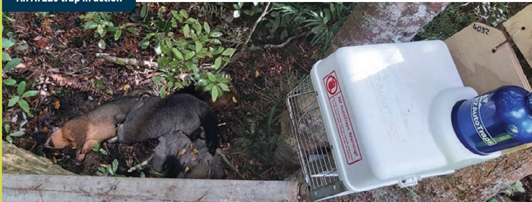
An AT220 trap in action

The results of this and the other trials will help the council develop criteria around when and where this control method could be employed as part of the suite of tools available to us when controlling pest animals at a landscape scale in the region.