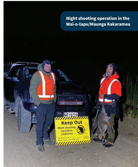
Night shooting operation in the Wai-o-tapu/Maunga Kakaramea