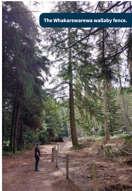
The Whakarewarewa wallaby fence.

The National Wallaby Programme has also been constructing a wallaby fence along SH5/ south-western boundary of Whakarewarewa forest, also with the aim of reducing dama wallaby spread from the containment area.