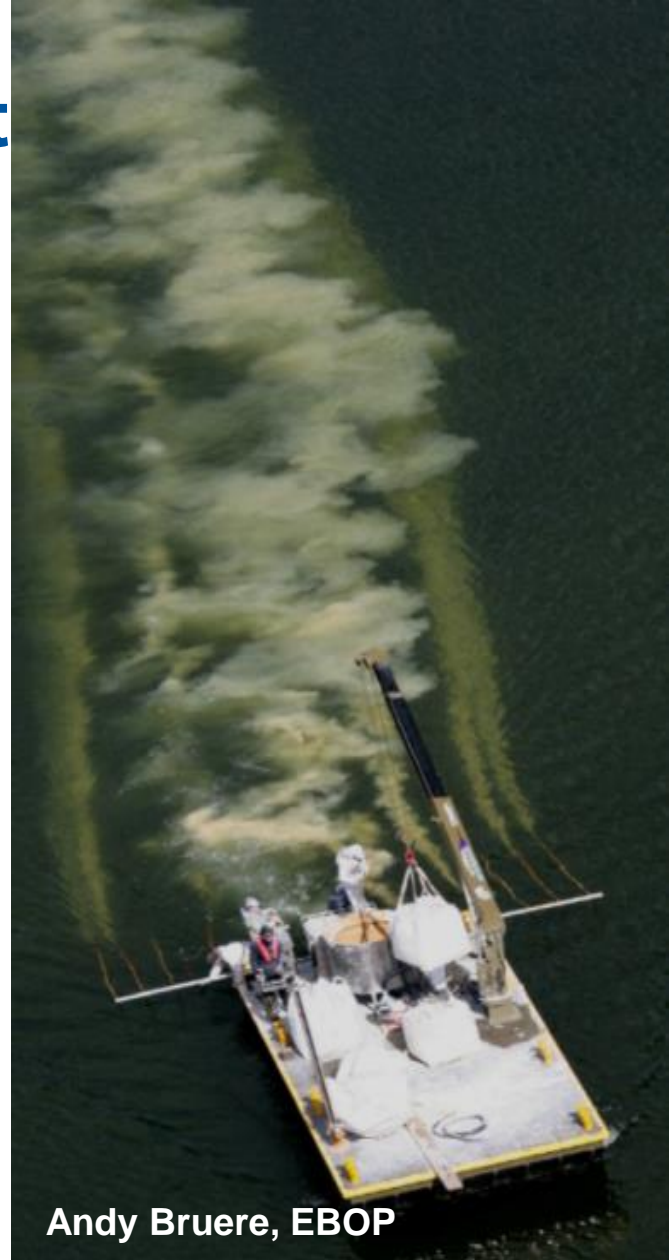
Andy Bruere, EBOP

Trials of flocculants/dredging not warranted until external nutrient loads are substantially reduced (>50%) and as part of integrated restoration programme