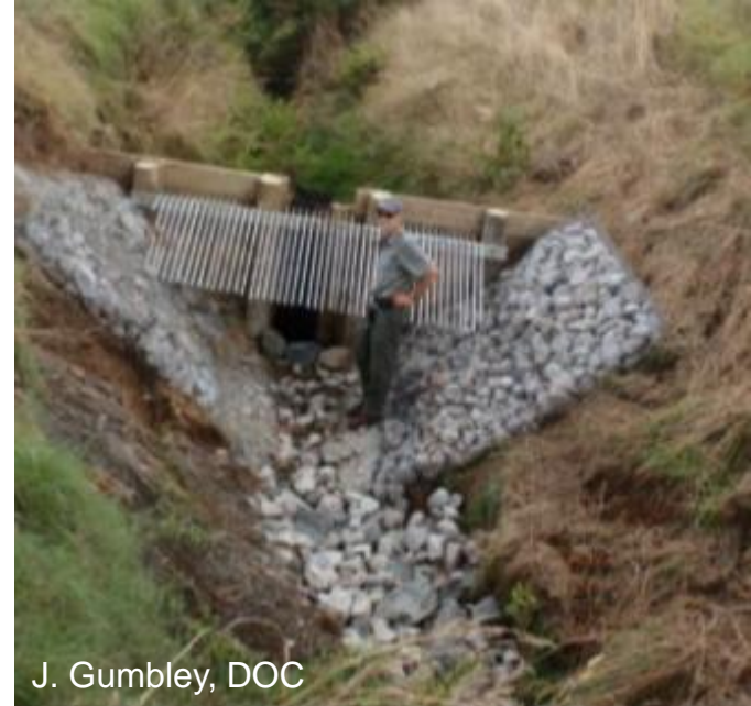
J. Gumbley, DOC

Experimental pest fish control on a lake-by-lake basis