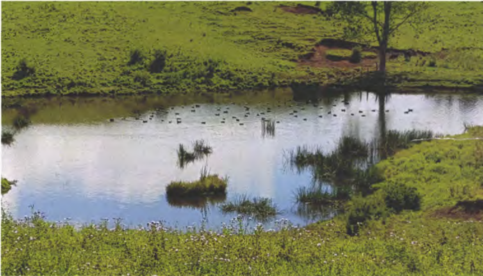
Example of uncontrollable pathogens (above and below)