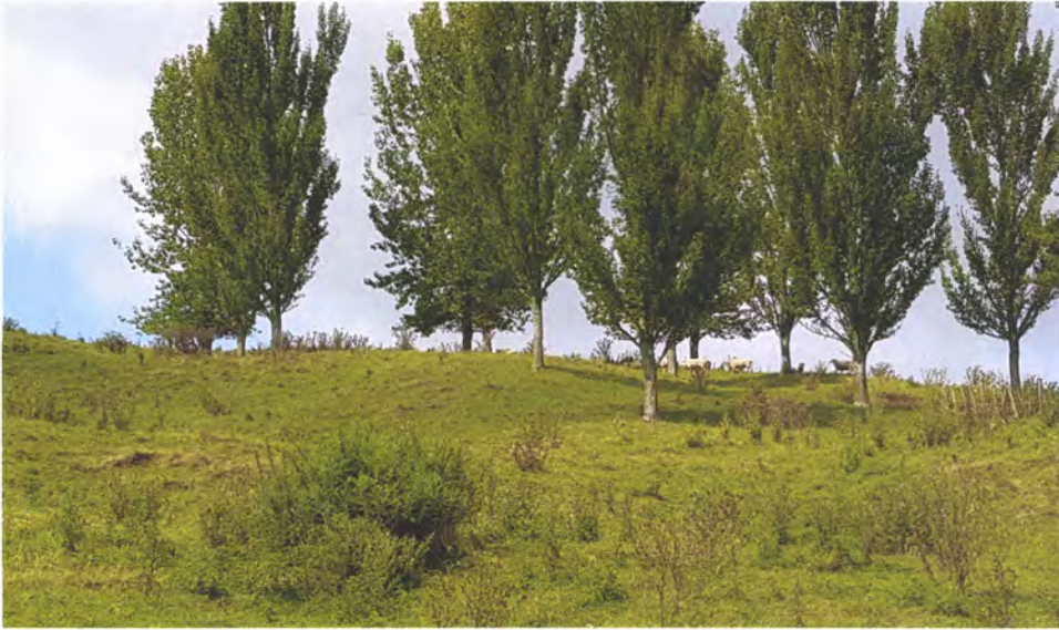
Example of planting to stabilise hillside with lighter stock