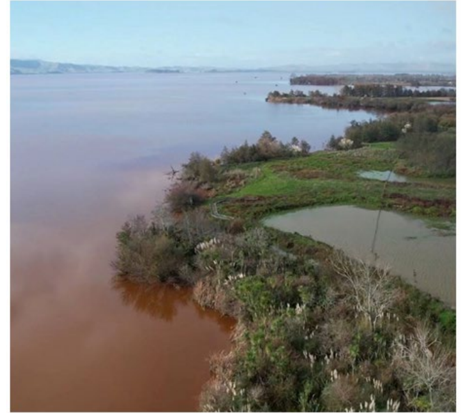
KAITIAKI FRAMEWORK FOR LAKE WAIKARE & THE WHANGAMARINO WETLAND